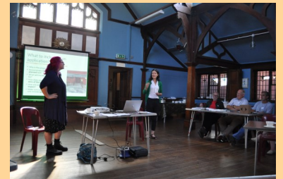
Who said that?