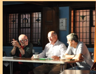
Three wise Monkeys